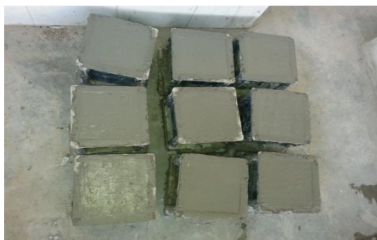
Fig.2 Casting of cubes