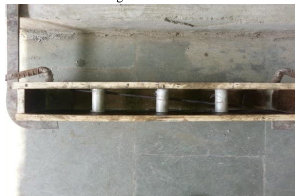
Fig. 5 shows the casting and testing of the beam with 3 openings. The cracking pattern of the beam can be seen in this figure.

Initially 3 beams are casted and tested on the UTM without any reinforcement in it having one, two, three openings respectively on each beam of size 28mm so as to identify the cracking pattern due to which the beam fails. Fig. 4 shows the formwork of the beams and placing of PVC pipes so as to form the required openings.