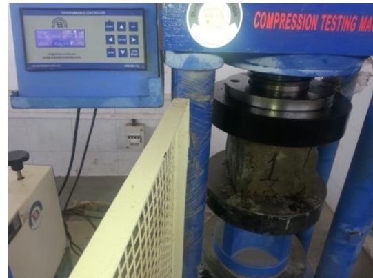
Fig. 3 Testing of Cubes.