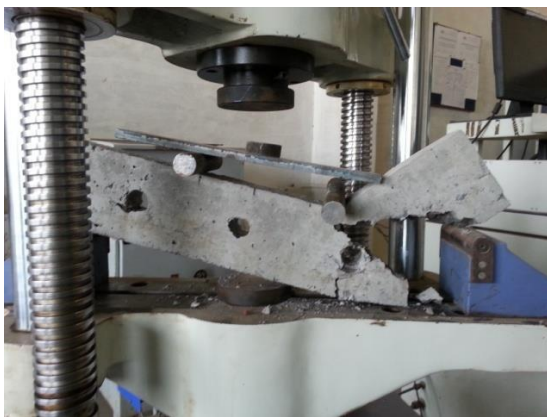
Fig. 5 Casting and testing of beam with three opening.