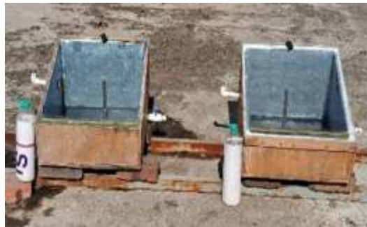
Figure 1. Experimental schematic of the single-slope, single-basin solar still configuration.

Two identical single basin single slope solar stills with a basin area of 0.25 m 2 were fabricated and installed side by side at SSASIT College, Surat, Gujarat, India. One still employed a black-painted galvanized iron absorber plate, while the second utilized a hybrid nano-coated absorber plate prepared using a 30% concentration of Cu–SiC nanomaterials (25% Cu and 75% SiC). Similar methodologies have been reported in earlier studies [9–11].